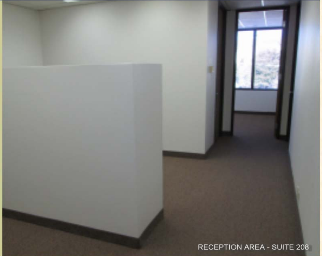
RECEPTION AREA - SUITE 203